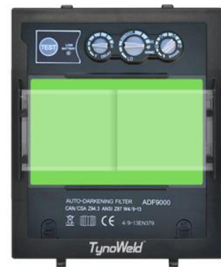
Magnifying lens/Welding filter lens Holder