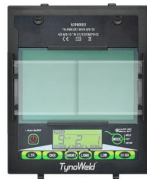
Magnifying lens/Welding filter lens Holder