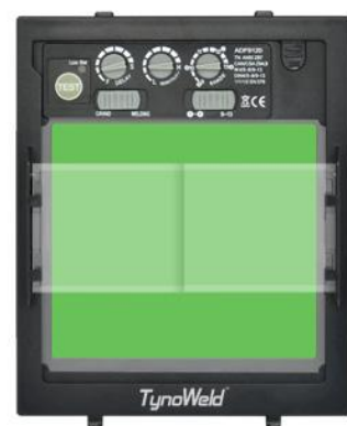
Magnifying lens/Welding filter lens Holder