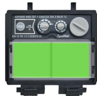
Magnifying lens/Welding filter lens Holder